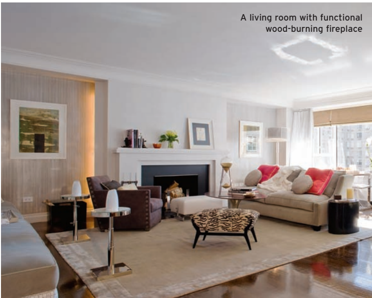
A living room with functional wood-burning fireplace

faithful to the original design of Gordon Bunshaft in terms of a framework for the renovation," Fallon says. "We've brought some great design talent, engineering sophistication and luxury upgrades that are available to us now but weren't then. I think it's a tremendous complement; it's where old meets new." ♦