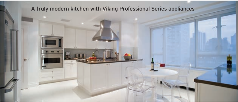
A truly modern kitchen with Viking Professional Series appliances